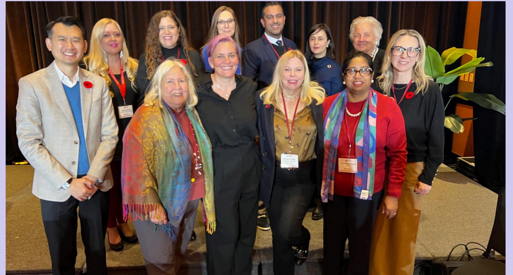
CNPEA Executive Director surrounded by partners and collaborators at the Provincial Summit on Aging, Richmond, BC, November 2024.

Sign up to become a member and receive our e- newsletters: https://cnpea.ca/en/get-involved